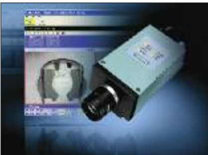
Siemens teams its SIMATIC Visionscape image processing software with its HawkEye 1600T Smart Camera

Nabtesco Tough solutions for tough design problems