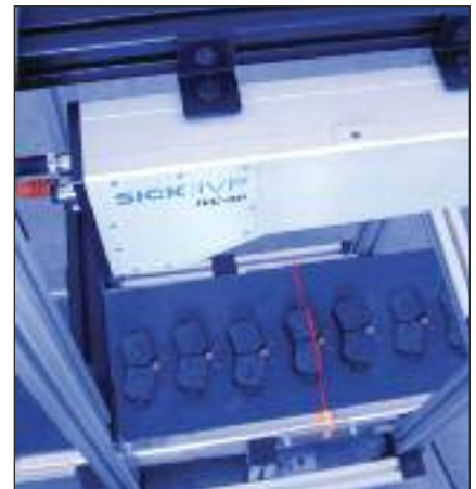
Vision systems using cameras such as SICK’s IVC-3D inspect intricate surfaces such as brake pads.

Software advances have been accompanied by more powerful hardware. “The most noticeable difference is the speed of the computing hardware, which is several orders of magnitude faster than years ago,” said Novini.